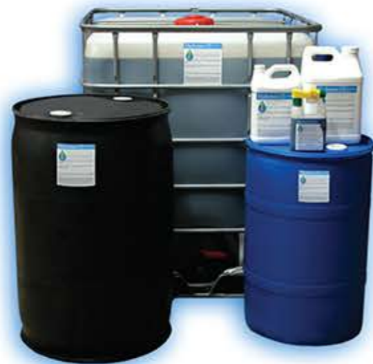
Hydretain is available in an array of package sizes ranging from 1 quart hose-end sprayers to 275 gallon totes.

Caution: If Hydretain is applied to open flowers blooms, rinse with plain water to reduce the possibility of Hydretain pulling moisture from sensitive flower petals.